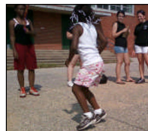
Baltimore Street Outreach