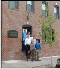
TC Induction Center

“Give instruction to a wise man and he will be still wiser. Teach a righteous man and he will increase his learning.” Prov. 9:9