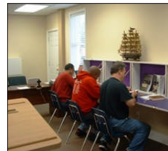
Potomac Center Classroom

*Some scholarships from TC, home church or sponsor