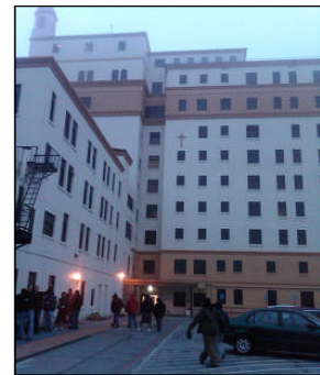
Los Angeles Dream Center

"Without prophetic vision people run wild, but blessed are those who follow God's teachings."