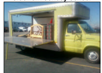
Stage Truck Purchased