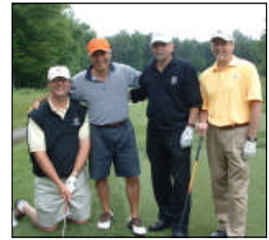
Pastors Got To Have Fun Too

come. Just come prepared to test your skills, have some fun, and enjoy a memorable day other friends of TC at a beautiful and challenging golf venue. Lots of prizes will be awarded, and our Silent Auction will be open after play. Please consider taking advantage of the available personal and business sponsorships, which support the cause of overcoming substance abuse, and build-